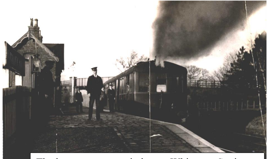
The last passenger train leaves Whitegate Station, 31<sup>st</sup> December 1930.

Once the Winsford and Over Branch Line and running for six miles from Cuddington to Winsford, the railway line served Whitegate & Marton and the Meadowbank Salt Works, together with the townspeople of Winsford